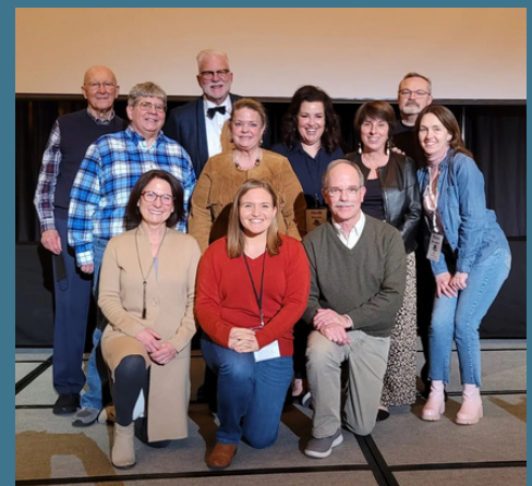
2021 NADCE BOARD MEMBERS AND AWARD RECIPIENTS